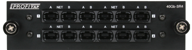
40G: F4MY-SR4 / 100G: F4MY-SR10

Profitap MTP fiber optic TAPs are designed to enable flawless in-line monitoring of 40G and 100G fiber optic networks. Our MTP TAPs use some of the most advanced fiber optic technology available in order to bring you exceptional density and performance within an exceptionally compact footprint. We ensure instant, optimized use of your 40GBASE-SR4 and 100GBASE-SR10 networks with complete traffic visibility, zero downtime, zero packet loss, and no point of failure.